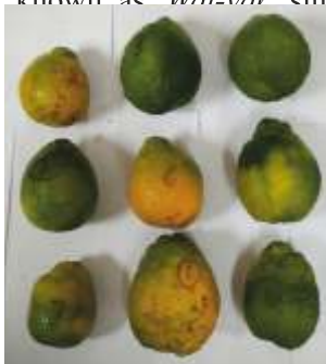
Different shapes of oblongated fruits in Nagpur mandarin

The length-breadth ratio of oblongated fruits was higher due to which it showed the abnormal fruit shape as compared to the