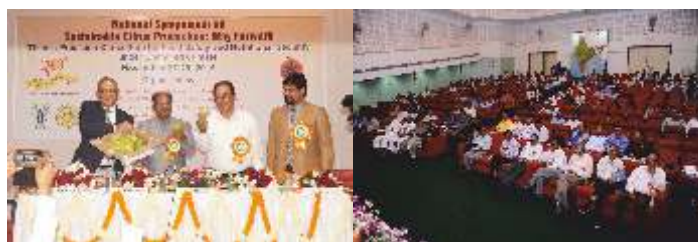
Dignitaries displaying Valencia Sweet orange

National Symposium on Sustainable Citrus Production - Way Forward : ICAR-Central Citrus Research Institute, Nagpur organized a 3-day National Symposium on "Sustainable Citrus production - Way Forward" to commemorate 30 years of its service during 27-29 November, 2015 in collaboration with Indian Society of Citriculture (ISC), Nagpur and Technology Mission on Citrus for Vidarbha, Marathwada and Chhindwara.