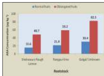
Abscisic acid (ABA) concentration (µg kg -1 ) in different rootstocks of Nagpur mandarin

normal fruits. The reduction of TSS and Vitamin C content and increase in acidity and peel thickness were also recorded in oblongated fruits as compared to the normal fruits in all rootstocks. More importantly, abscisic acid (ABA) level found to be increased (~80 µg kg -1 ) in plants with excess soil moisture with higher number of oblongated fruits as compared to the normal fruits (~15 µg kg -1 ). It indicated that