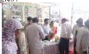
Agriculture festival, Warud

Scientists delivered lectures and had interactive session with the farmers.