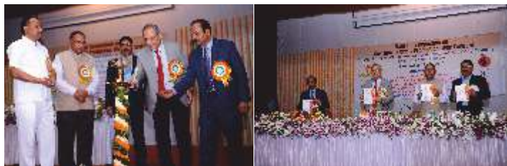
Dignitaries lighting the lamp and releasing the publication

inaugural session. He stated that old heritage orchards needs to be protected as mother trees of high quality fruit.