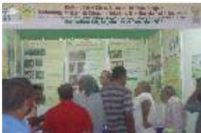
Horti Fair, Bagalkot